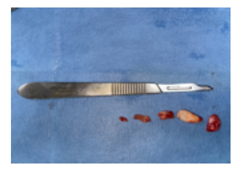
Fig. 4. Extracted tooth together with dental follicle and odontomas