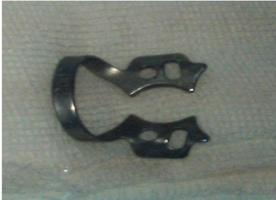
Figure 2. Ingested rubber dam clamp

On the third day, he was allowed to feed orally and he didn't experience any problems. He was discharged on the fourth day. On the one week follow-up the patient told that, he didn't feel any discomfort and he could feed himself without any problem. The otolaryngologists agreed that he was completely healed and no more follow ups were necessary. The lower right second molar was extracted due to a vertical fracture.