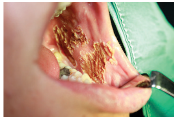
Figure 3. Post-operative Image

No suture was applied after the excision and the area was left for secondary healing (Fig. 3)