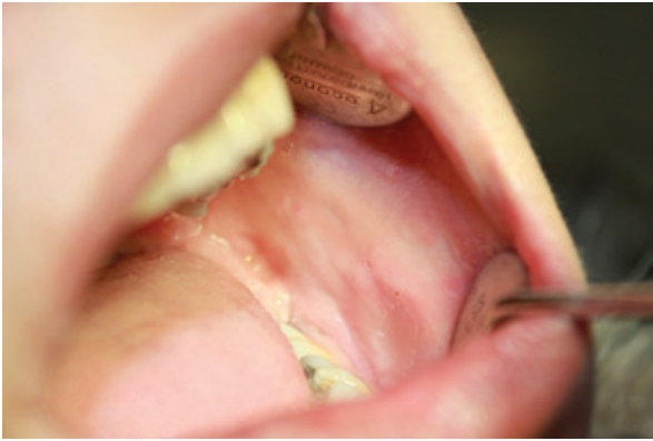
Figure 4. Intraoral image after 24 months

No complications were observed during a routine follow up period following the healing period. No recurrence occurred after 24 months of follow-up (Fig. 4).