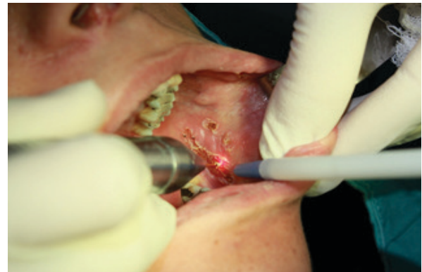
Figure 2. Excision of the lesion with diode laser

Oral lesions were treated with serial partial excision using diode laser. (Fig. 2) The diode laser was applied with excitation wavelengths of 810 nm, 4.0 W power, 0.5 MS continuous wave and 1000 Hz frequency power.